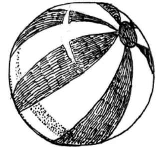
sand (beach ball size)

Gardeners describe soil types in many ways: heavy, light, sandy, clay, loam, rich loam, and so on. Scientists and horticulturists classify soil types by the proportion of sand, silt, and clay particles they contain, based on the sizes of mineral particles. The texture of the soil is determined by the blend of these various-sized particles. Classifying the soils in our garden will give us some indication of the problems we are likely to encounter in working with them: Soil that has too much clay is hard to work and Soil that has too much sand dries out fast . Through the years it is possible to change the texture of soil by adding amendments such as sand and compost to balance the proportions.