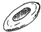
silt (Frisbee size)